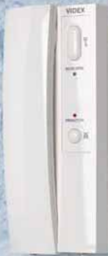
Art.3125 Art.3126 Art.3176 Art.3195 Art.3196