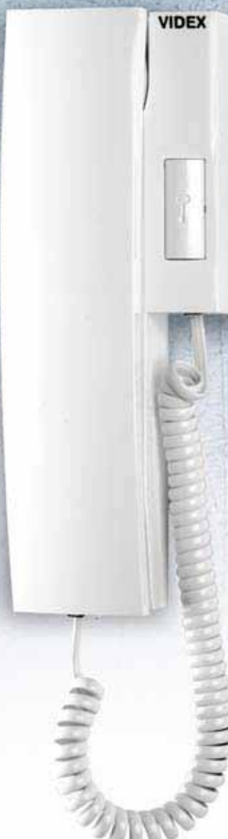
Art. 3001 Art. 3011 Art. 3021