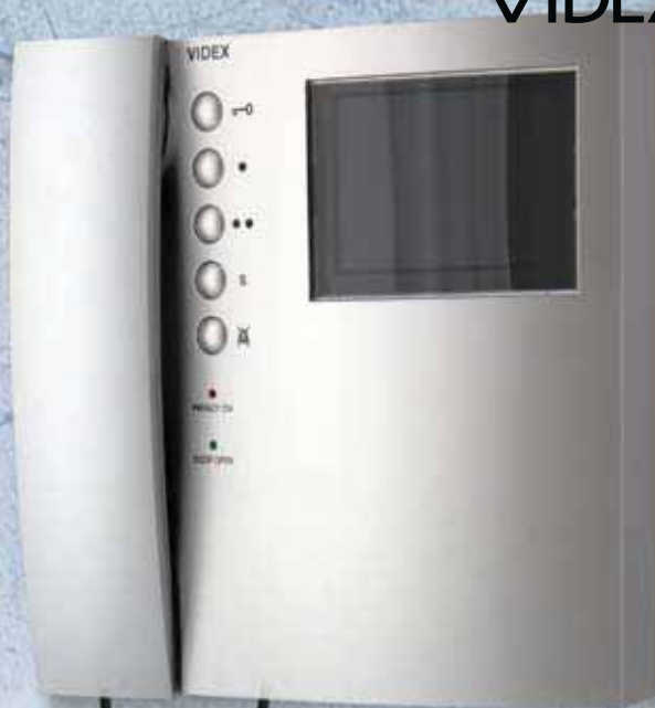
Art.33xx/CR Art.34xx/CR Art.35xx/CR