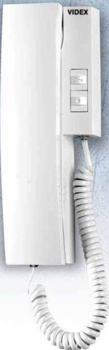
Art. 3002 Art. 3012 Art. 3022