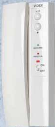
Art.3114 Art.3124 Art.3181