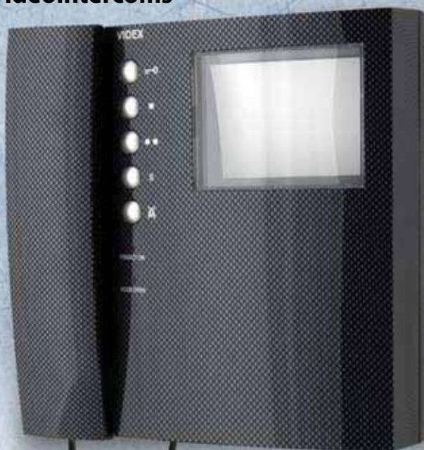
Art.33xx/CA Art.34xx/CA Art.35xx/CA